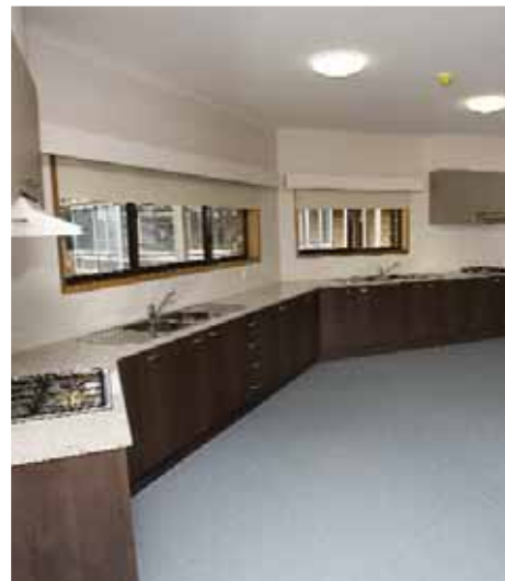
Kalimina House (Healesville)

Media attention is increasing on unscrupulous boarding house proprietors charging exorbitant rents for dangerous and unhealthy living conditions. The plight of some of the country's most vulnerable is forcing policy makers to focus their attention on resolving the issue.